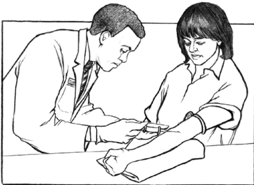
Blood is drawn for hepatitis B testing.

Your doctor may suggest getting a liver biopsy if chronic hepatitis B is suspected. A liver biopsy is a test for liver damage. The doctor uses a needle to remove a tiny piece of liver, which is then looked at with a microscope.